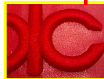
Before: Less Embossed and looked unappealing