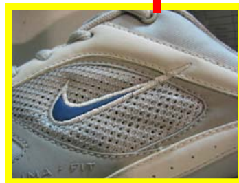
Before: Distorted Stitches at the joint part