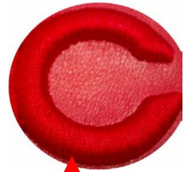
AFTER: Uniform Stitch Quality