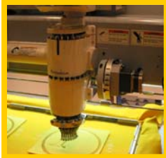
Accurate Pressure foot height Device mechanism

Barudan's DY/DS Series combines with the APFHA-Technology – that enabling Delicate designs of Thin fabric, 3D/EVA material or even Leather to a higher valued added and quality products !