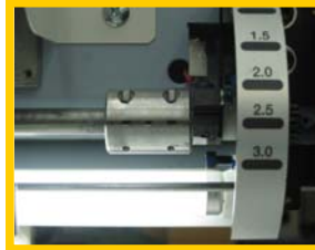
Auto Select Pressure foot height Adjustment